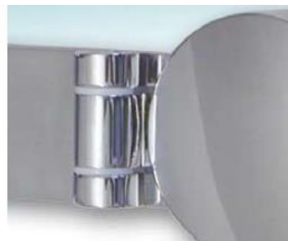
Supporting Arm VarionPlus 155 (screw system)